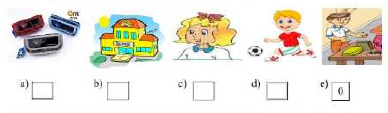
Ouestion 3: Listen and write T (true) or F (False). (1 nt)