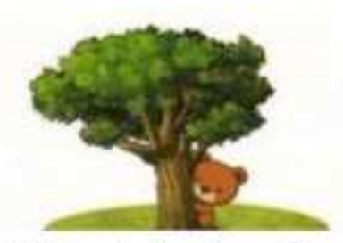
Where's the bear?