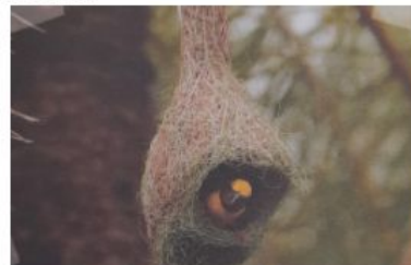
The nests hang from the branches of trees.