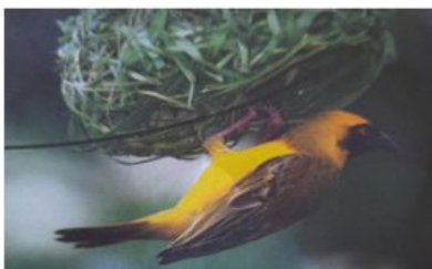
They make entrances to the nest