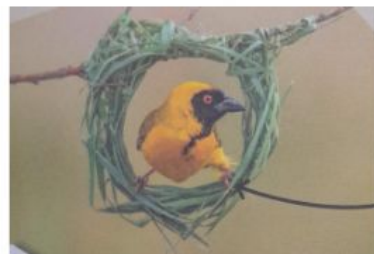
They weave grass, leaves and twigs into a nest.