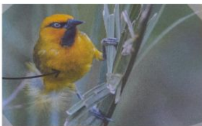
Weaver birds make their own homes