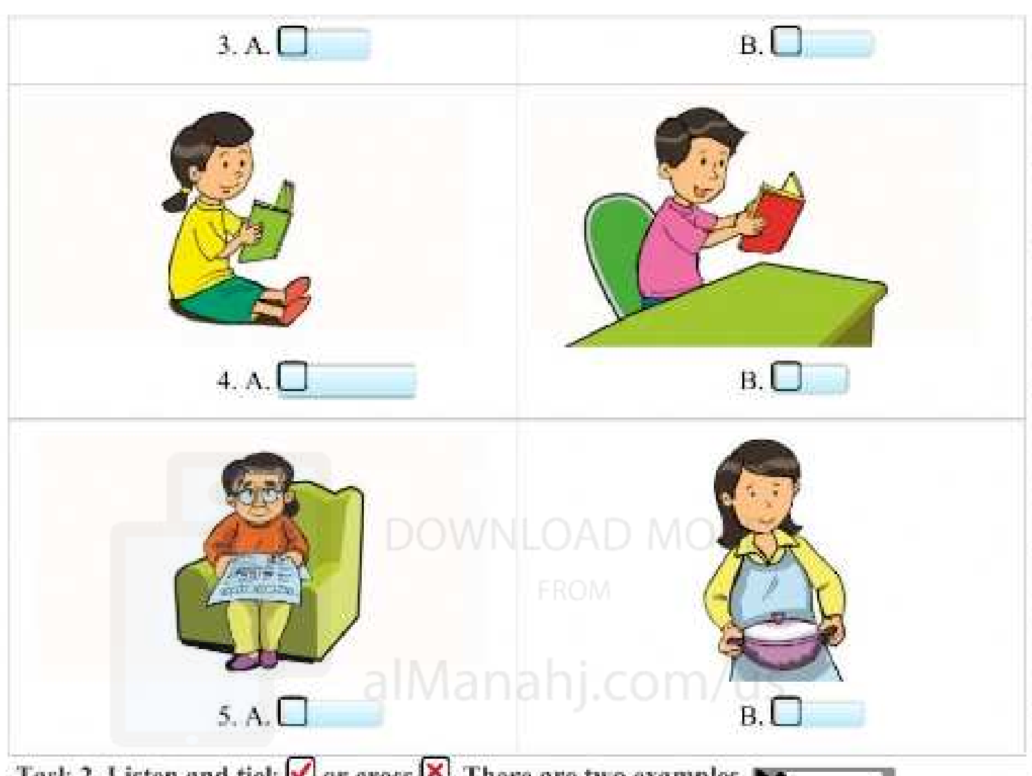
Task 2. Listen and tick ✓ or cross ☒. There are two examples. ► Examples: