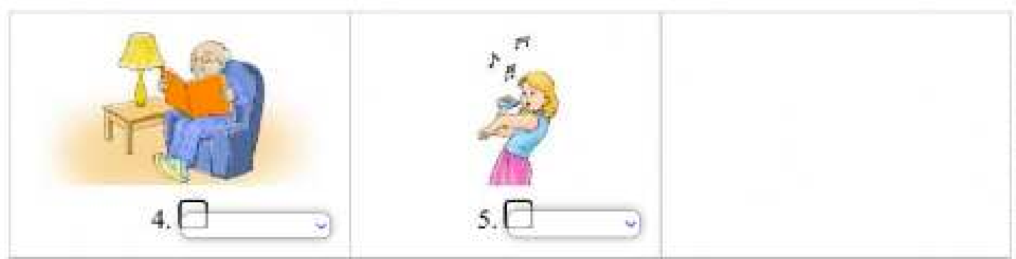
Task 3. Listen and number. There is one example (0)