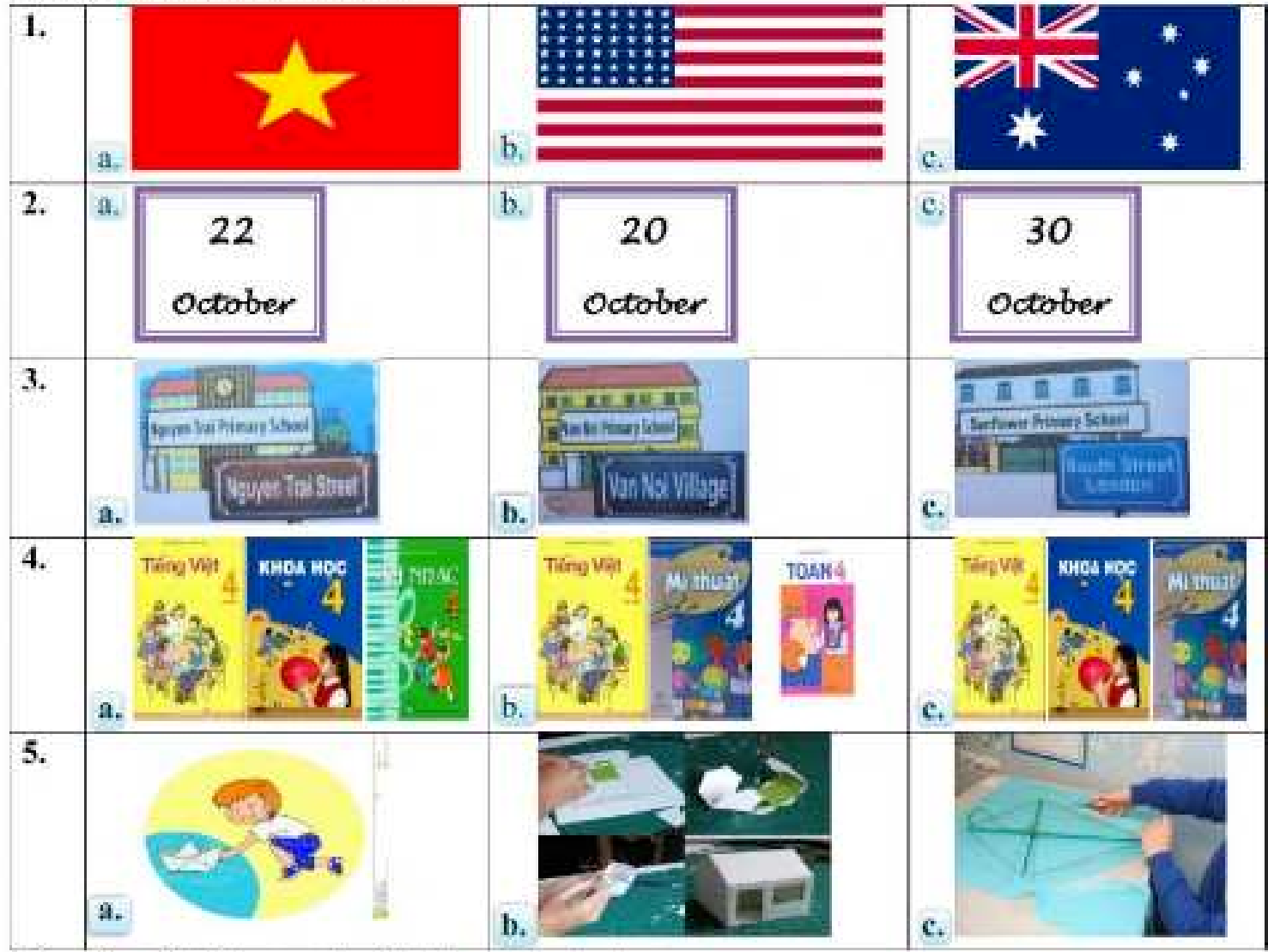
Question 3. Listen and write T or F in the box