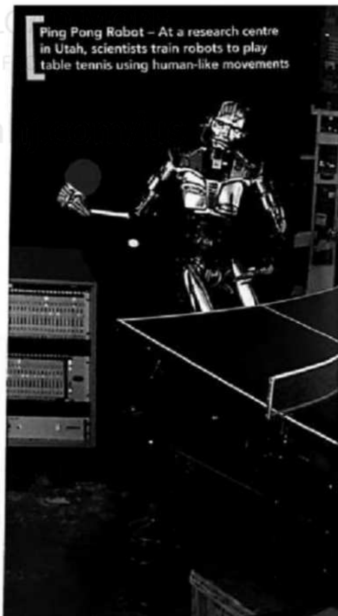
Ping Pong Robot – At a research centre in Utah, scientists train robots to play table tennis using human-like movements