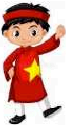
Nam / 8 / Vietnam