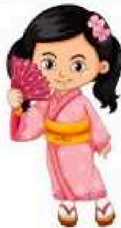
Mochi / 10 / Japan