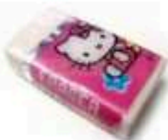
EG 1. A