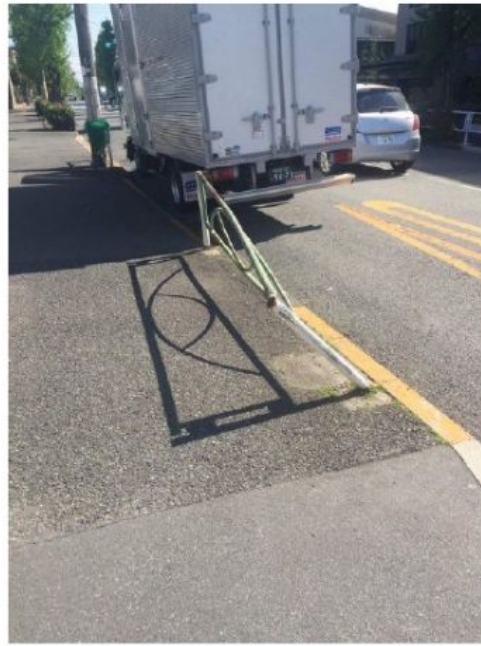
A bent gate

5. A bent gate , is it a physical or a chemical change?