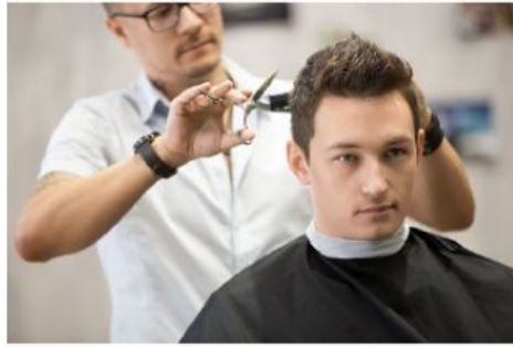
Getting a haircut

7. Cutting someone's hair , is it a physical or a chemical change?