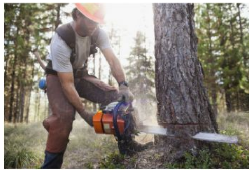
cut a tree

3. Is cutting a tree a physical or a chemical change?