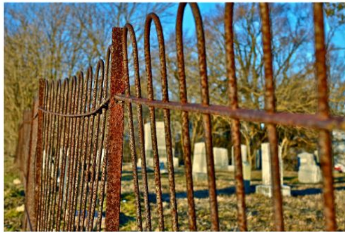
A rusted gate (valla oxidada)

6. A rusted gate , is it a physical change or chemical change?