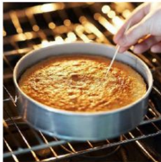
bake a cake: hornear

1. When you bake a cake , is it a physical or a chemical change?