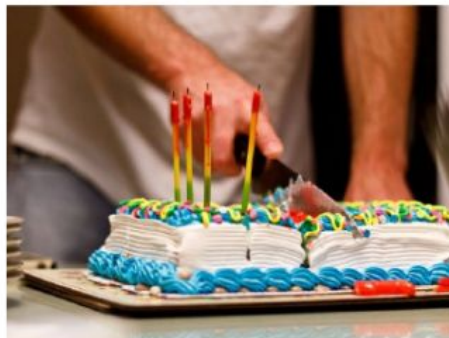
cut a cake

2. When you cut a cake , is it a physical or a chemical change?