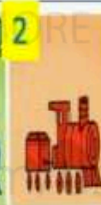
2 A short red train.