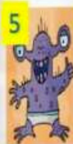
5 An ugly purple monster.