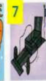
7 An old black go-kart.