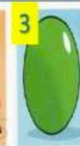
3 A big green ball.