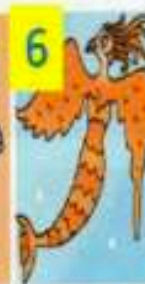
6 A beautiful orange monster.