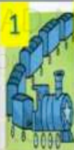
1 A long blue train.