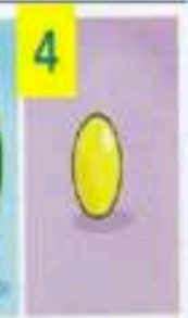
4 A small yellow ball.