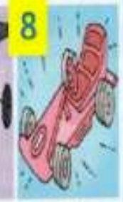
8 A new pink go-kart.