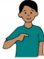
I / Me