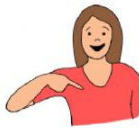
I / Me