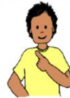
i / Me