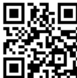
Table Periodic about Worksheet الملف

Almanahj Website → American curriculum → 7th Grade → Chemistry → Term 1 → The file