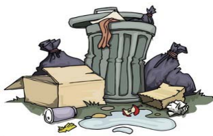
garbage / waste / landfill