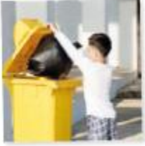
take out the rubbish