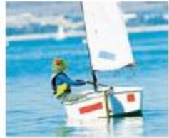
sail a boat