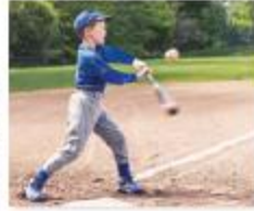
hit the ball