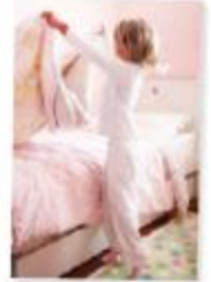
make my bed

-Fill in the gaps with the suitable words from the box: