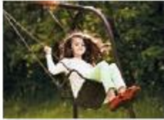
play on the swings