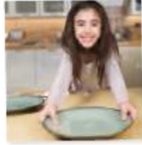
set the table