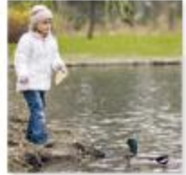
feed the ducks