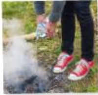
put out the fire