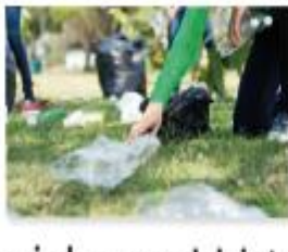
pick up rubbish