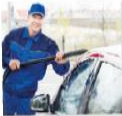
wash a car