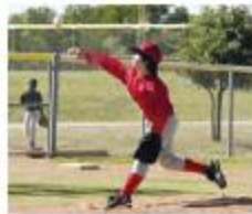
throw the ball