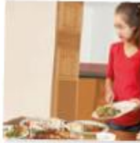
clear the table