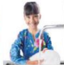
wash the dishes