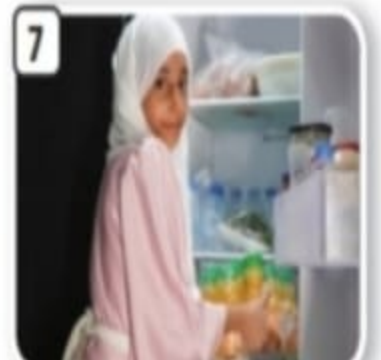
put away the shopping