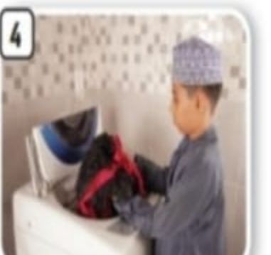
put clothes in the washing machine