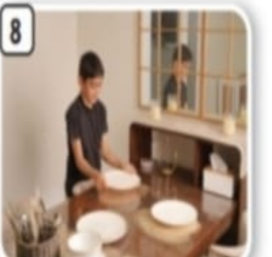
set the table