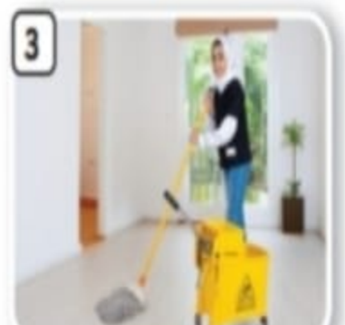
mop the floor