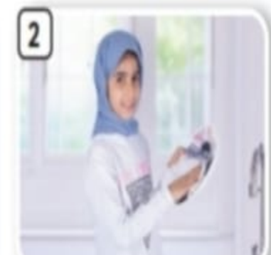
dry the dishes