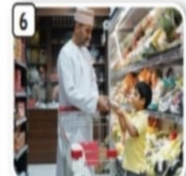
go food shopping