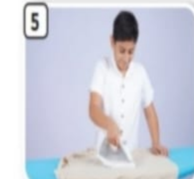
iron a shirt