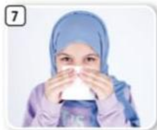
a runny nose