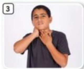
a sore throat