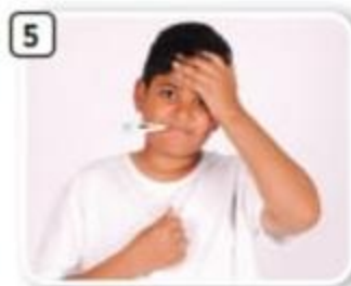
a high temperature