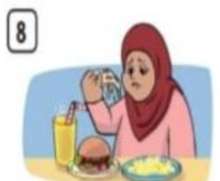
eat junk food