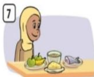
eat a balanced diet