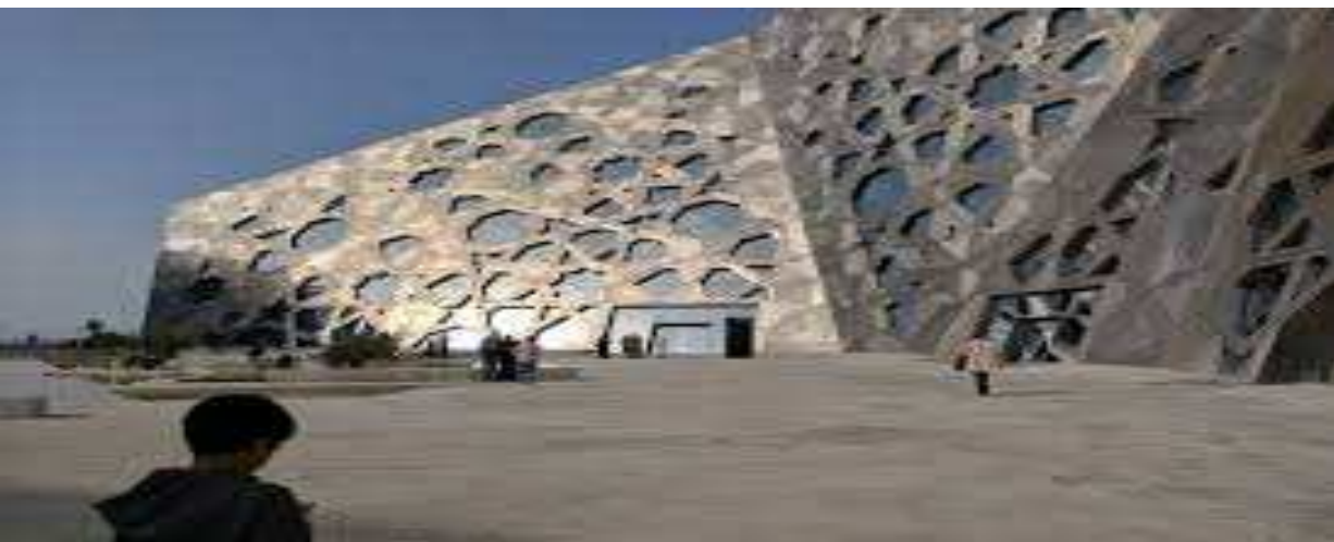
Jaber Al-Ahmad Cultural Centre