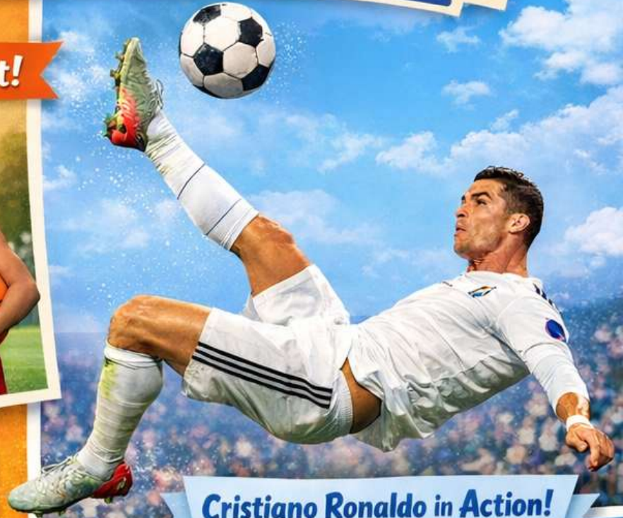
Cristiano Ronaldo in Action!