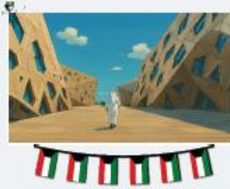
(discover – places)