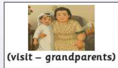
(visit – grandparents)

Eid Al-Fitr is a happy day. We wear new clothes. We pray in the mosque. We visit our parents.