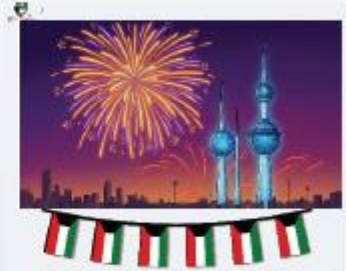
(watch – fireworks)