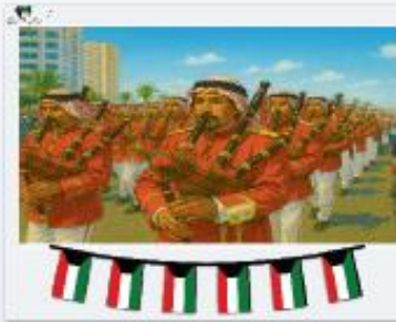
(march – street)

Write a paragraph about "Kuwait's National Day" with the help of pictures and guide words