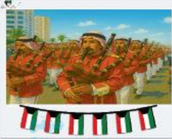
(march – street)

Write a paragraph about "Kuwait's National Day" with the help of pictures and guide words