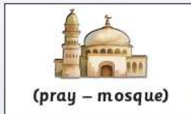
(pray – mosque)