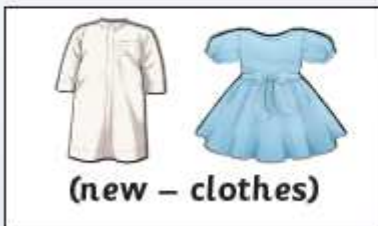
(new – clothes)

B) Write a paragraph about "Eid Al-Fitr" with the help of pictures and guide words