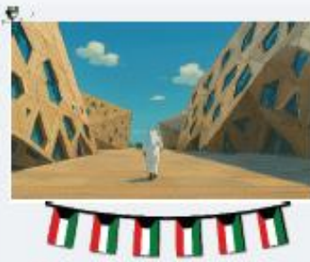
(discover – places)