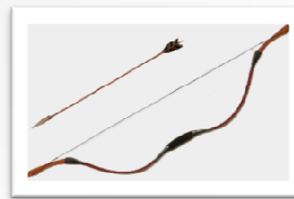
a bow and an arrow