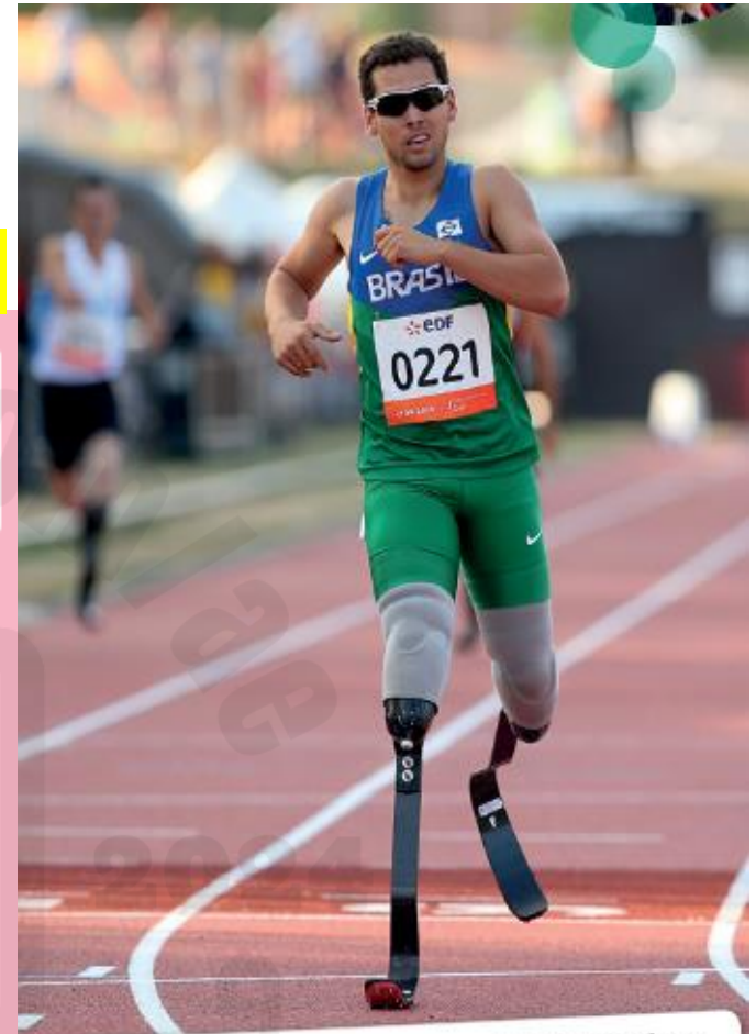
Para-athlete blade runner Alan Oliveira

Everyone is going to be talking about it at school. Everybody is going to be saying, 'We were there, we saw him break the world record!'