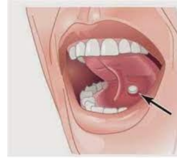
Figure 1: Sublingual drug delivery.[12]

41- Which route of drug administration involves placing the medicine between gum and cheek ?